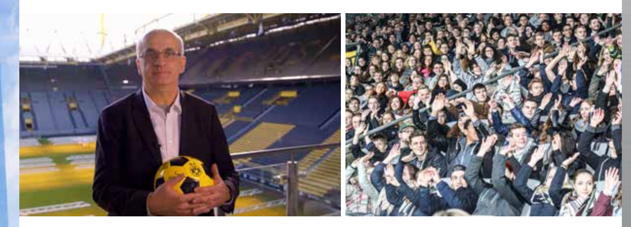
Welcome event for first-semester students in the stadium of the SIGNAL IDUNA PARK

Seven universities and some twenty research