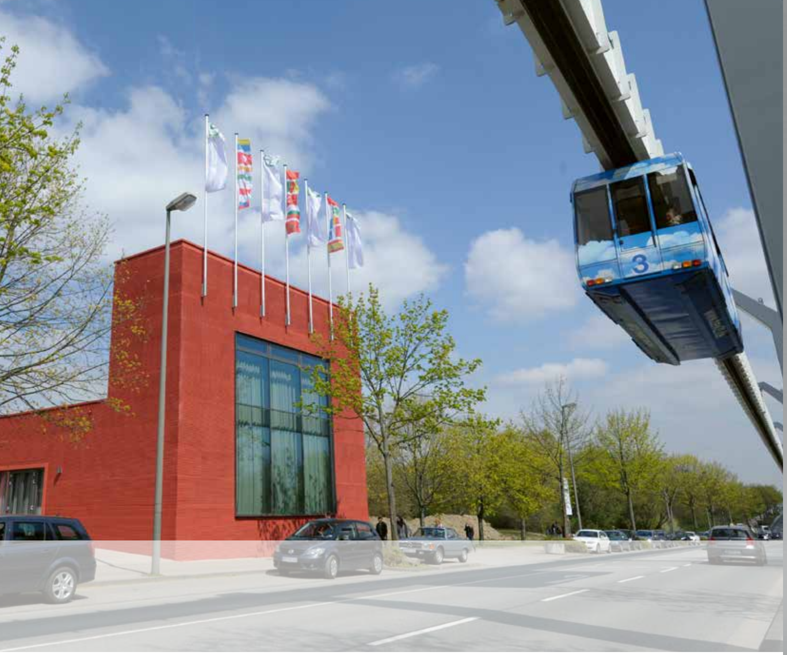
International Meeting Center IBZ